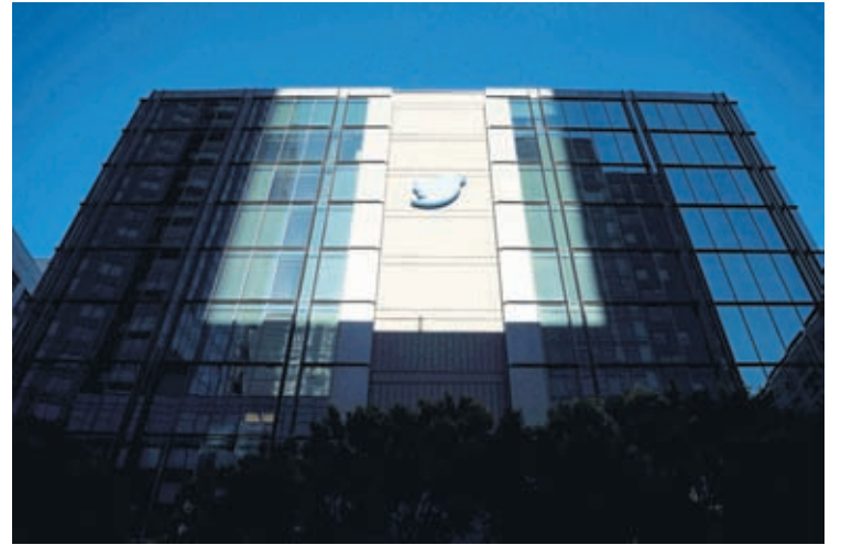
A Twitter logo hangs outside the company's San Francisco offices on Tuesday, Nov. 1, 2022.

Twitter said it will at least temporarily suspend accounts that include the banned websites in their profile. However, the practice is so widespread that it's not clear if — or how — the company will enforce the restrictions on Twitter's millions of users around the world. Twitter previously took action to block links to one of its rivals, Mastodon, after its main Twitter account tweeted about the @ElonJet controversy last week. Mastodon has grown rapidly in recent weeks as an alternative for